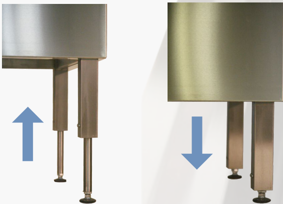
6" of work surface height adjustment to accommodate medical staff of various heights